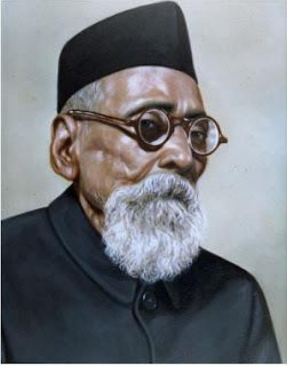
Bharatratna Maharshi Dhondo Keshav Karve